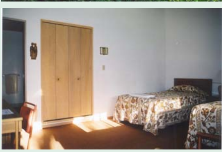
Our Guest Bedrooms Each room has 2 twin beds and a private bath. Our overnight capacity is 70.