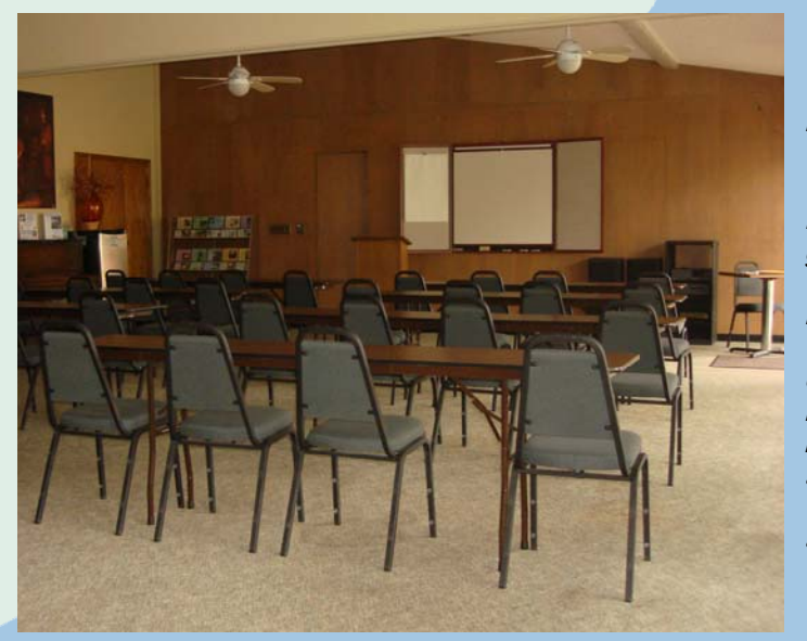
The Upper Conference Room

Our kitchen staff can serve groups of 15 to 200. Our delicious and healthy cuisine are elegantly presented buffet style. Special requests for your group, such as vegan or vegetarian menus, must be planned in advance. We are unable to accommodate individual dietary requests.